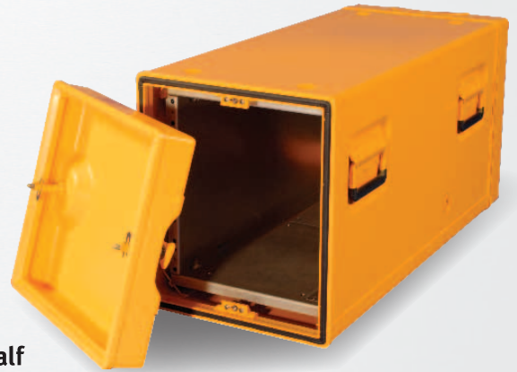
Half Rack with Cover

Contact EDAK for assistance with your transit case requirements.